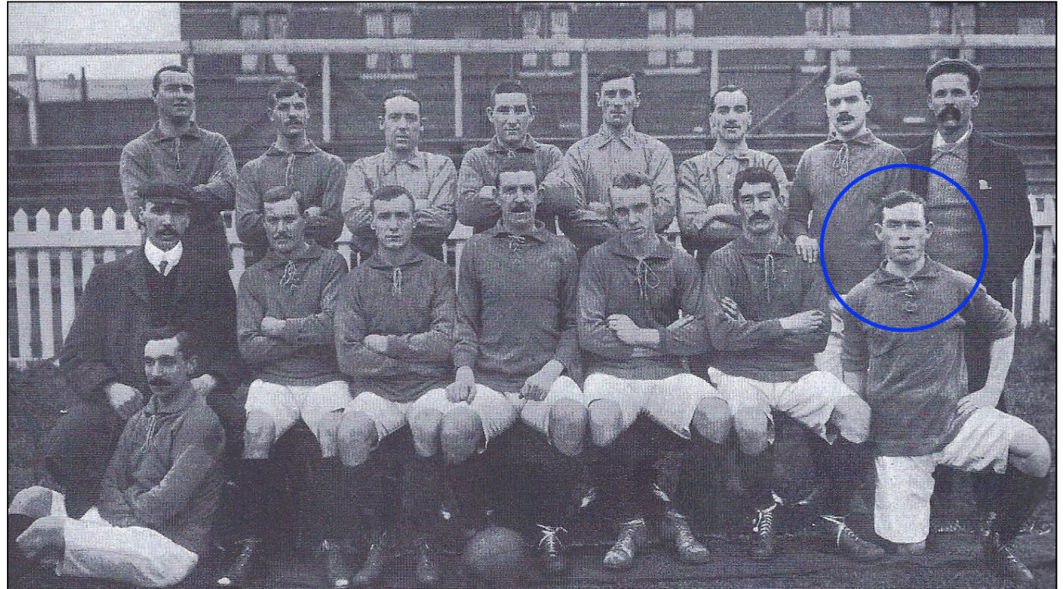
Leicester Fosse 1905-06