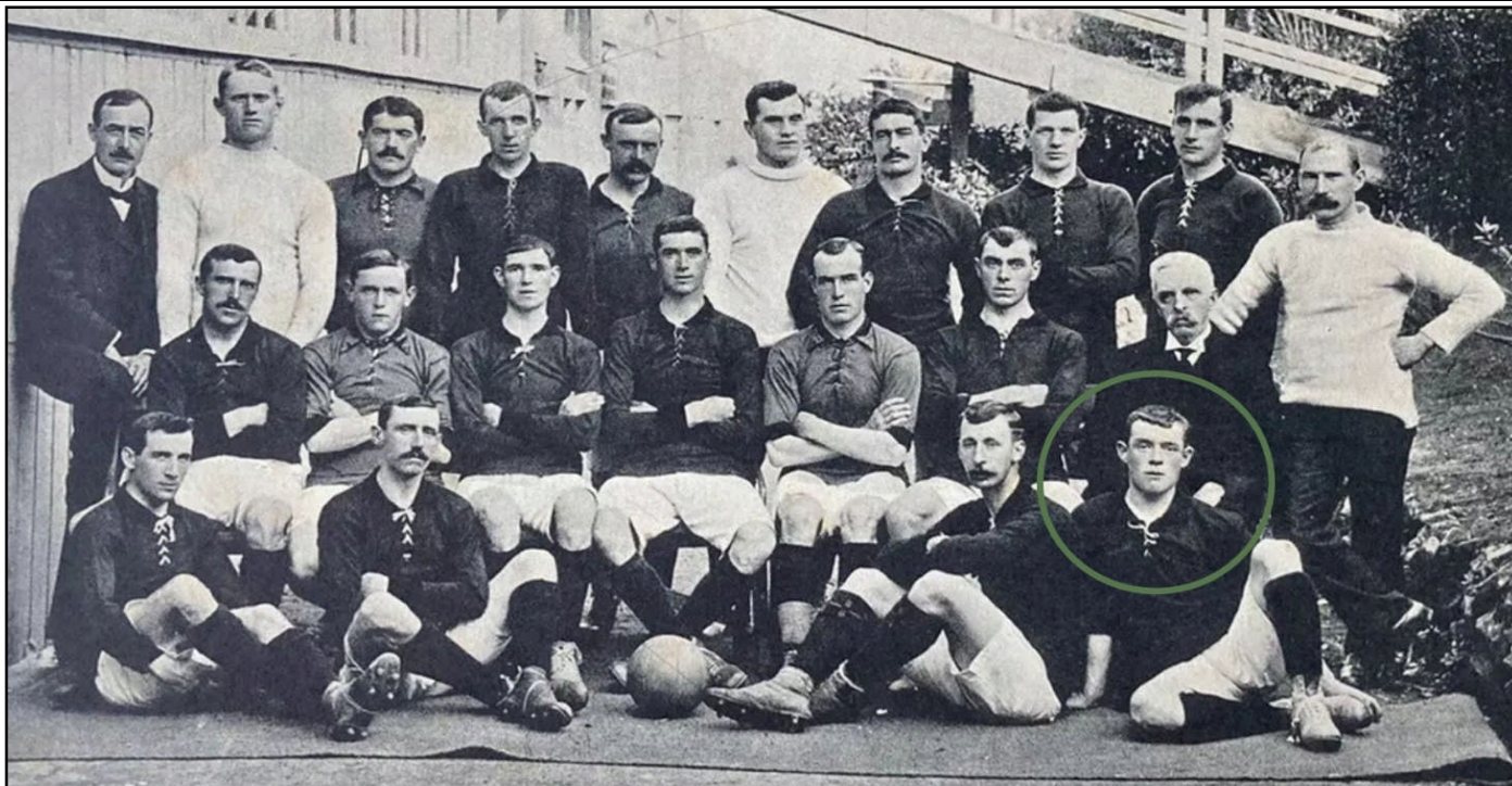
Plymouth Argyle 1904-05